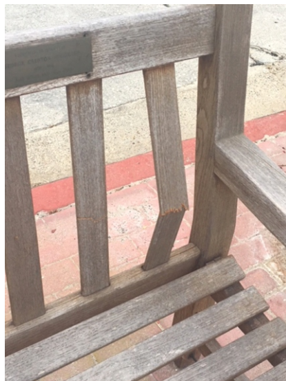
Damaged bench on South Bayfront