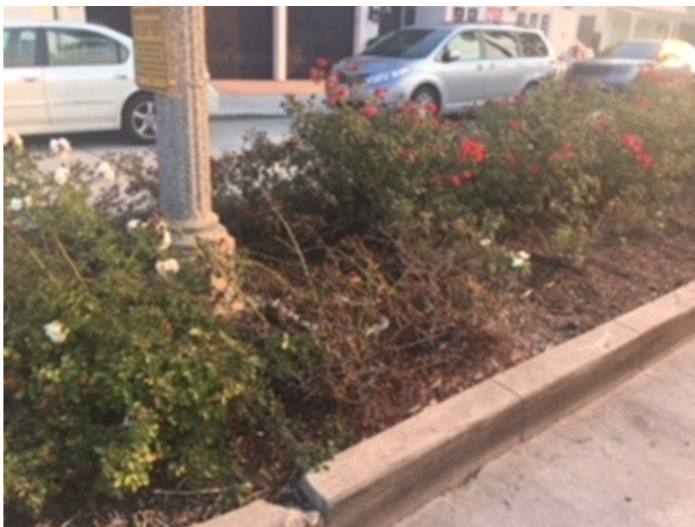
Recent photo of our median's landscaping