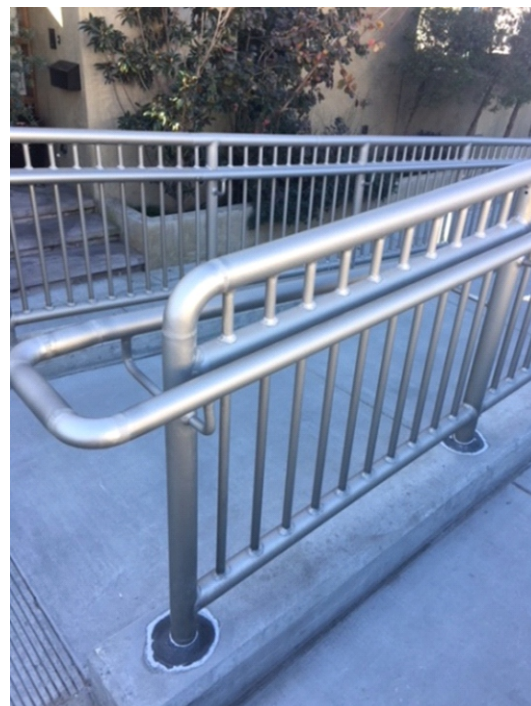
The current and controversial bridge rail